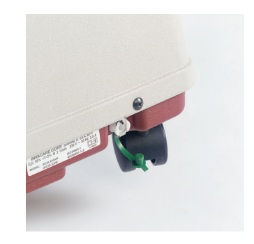
HomeFill® connection port